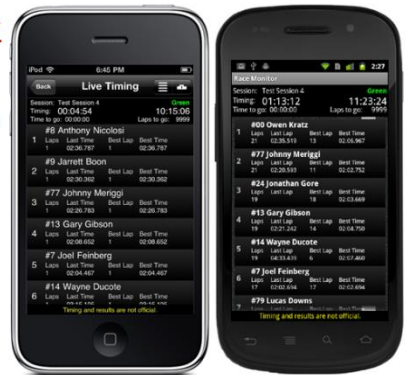
Some current and upcoming races